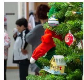
Christmas Open House