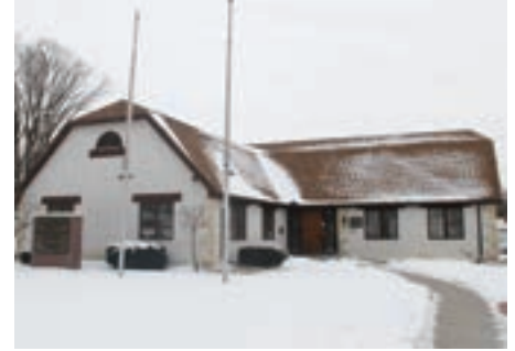
The Germans from Russia Museum is open year-round, Monday through Friday from 9 a.m. to 4 p.m.

American Historical Society of Germans from Russia membership is open to anyone interested in joining. Options include a basic membership for $35 or a standard membership for $50, which includes a quarterly journal