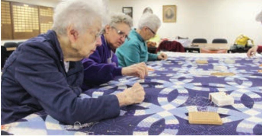
In the museum's basement, AHSGR Lincoln Quilters members work tirelessly on a quilt. This is one of the oldest volunteer groups that work for the benefit of AHSGR.